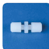
4 mm Union Fitting