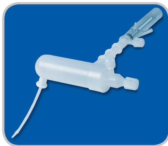
7700/7800/7900/8x00 PFA Inert Sample Introduction

Savillex worked very closely with Agilent to design an PFA inert kit that avoids the common problem of droplet formation in the connector tube, which causes instability and can even extinguish the plasma. The connector tube is an easy push fit design and the end cap is o-ring free to minimize contamination and features a make-up gas port. The demountable torch uses an o-ring mount, which ensures a correct fit with the torch and allows it to be easily dismantled. Injectors are available in either sapphire or Pt, with 2.5 mm ID. Versions for organic sample analysis are available, featuring smaller diameter 1.5 mm injectors, and a gas port for O 2 addition. All parts that come into contact with the sample come precleaned, ready for immediate use. Savillex inert kits are supplied with a genuine Agilent quartz torch and are exactly as supplied as original equipment with the 7500, 7700, 7800, 7900 and 8x00 Series. These kits are the highest performing inert kits available for ICP-MS, and used by all leading semiconductor labs around the world. Choose one of the kits below and add one of the Savillex nebulizers to make a complete inert sample introduction system.