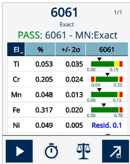
Fast, on-screen alloy ID with easy Pass/Fail feature for rapid verification

Get the ruggedness, ease of use, and data management features of our advanced Vanta analyzers in a cost-effective Si-PIN detector model. L Series analyzers offer quick alloy grade and chemistry verification of metals and alloys where elements lighter than titanium (Ti) are not critical to sort and verify (most stainless and nickel grades, many aluminum and titanium grades).